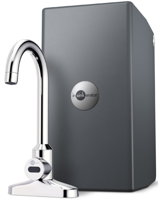
Deck mounted faucet configuration